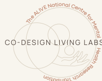
Co-Design Living Labs Victoria

This module is delivered in partnership with: